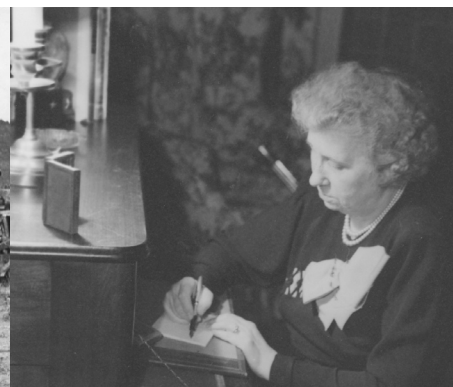
Bess Truman in March, 1946, writing a note at a desk. This photo is from the collection of Truman Papers, Family, Business and Personal Affairs, which was described by a volunteer.