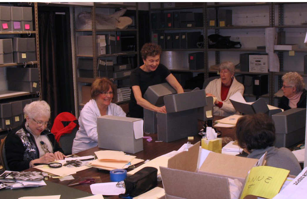
Members of the National Council of Jewish Women, who are assisting with the Congregation Beth Israel Project.

We consider the project a success once the collection has been entirely processed and turned over to the archivist for final arrangement and description.