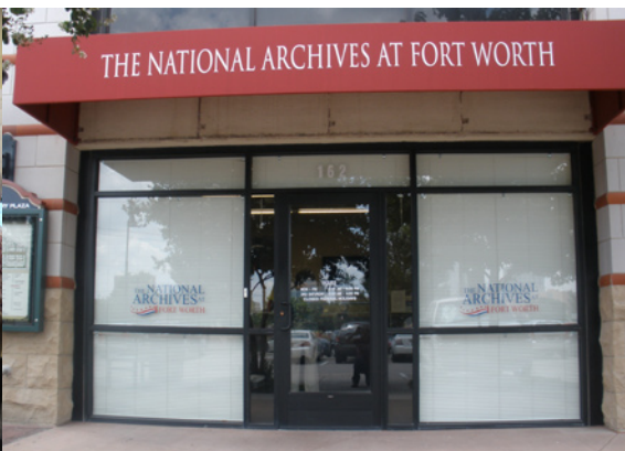
The Montgomery Plaza facility of the National Archives at Fort Worth.